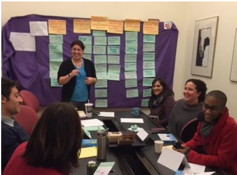
Arts Vision Meeting at Southwest Interagency

This spring, your arts leadership coaches will be returning to schools one last time to facilitate your arts team meeting and support your creation of year 3 arts action plan. This one will focus on arts sustainability planning. Together, you will develop a plan for how you will capitalize on the systems that you have created to make your school an arts-rich community and move forward as an arts team and school in future years.